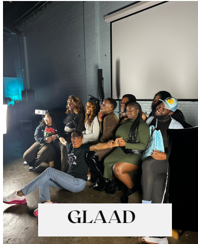
Black Trans Futures CO-hort 2024

Click on the image or text link to be taken to the original source.